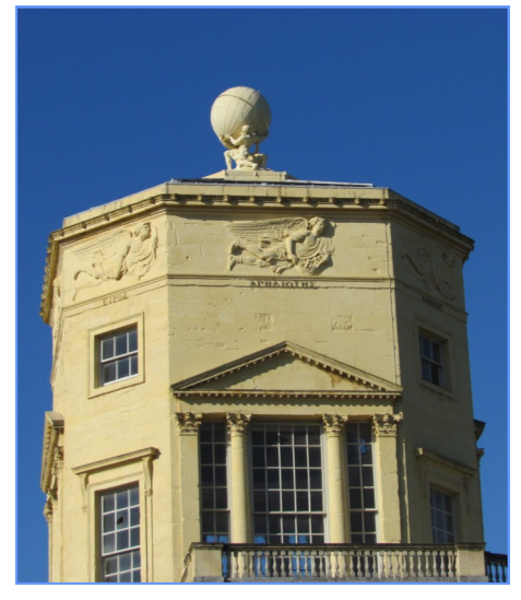
The Tower of the Winds Oxford, United Kingdom